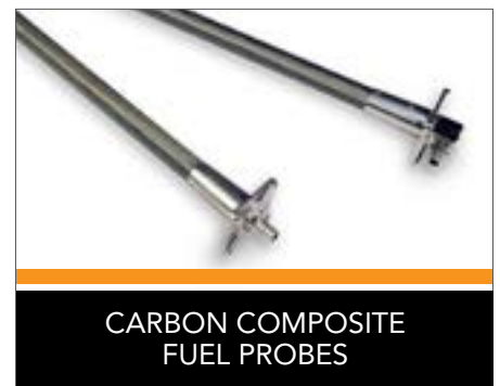
CARBON COMPOSITE FUEL PROBES