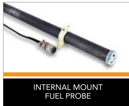
INTERNAL MOUNT FUEL PROBE