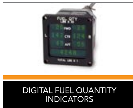
DIGITAL FUEL QUANTITY INDICATORS