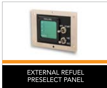
EXTERNAL REFUEL PRESELECT PANEL